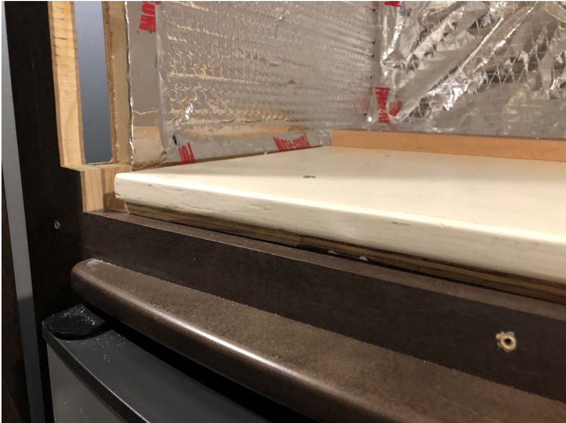
Microwave Replacement Photo 04