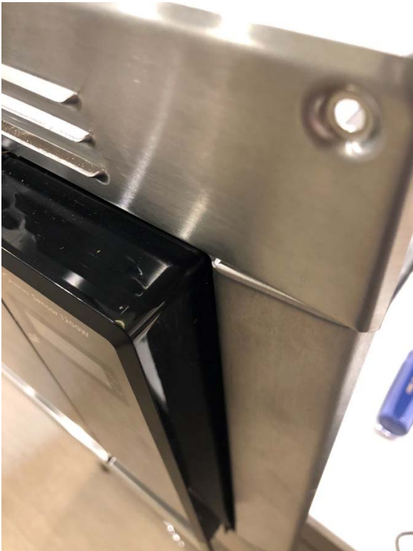
Microwave Replacement Photo 07