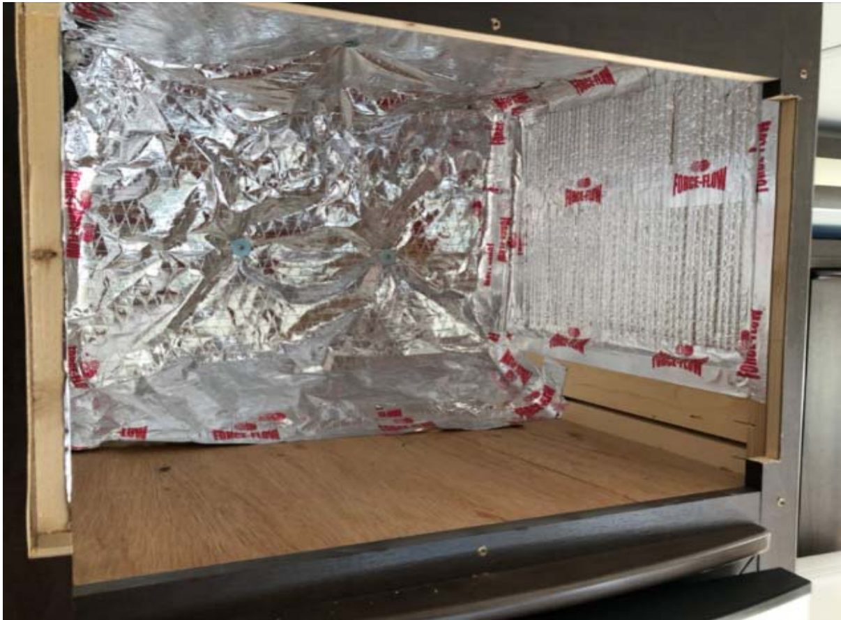
Microwave Replacement Photo 02