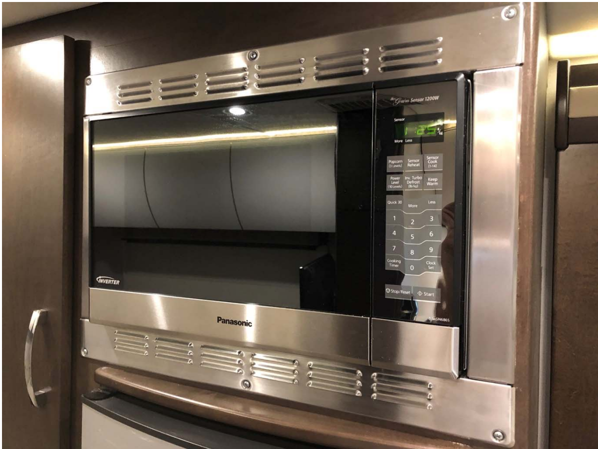
Microwave Replacement Photo 10