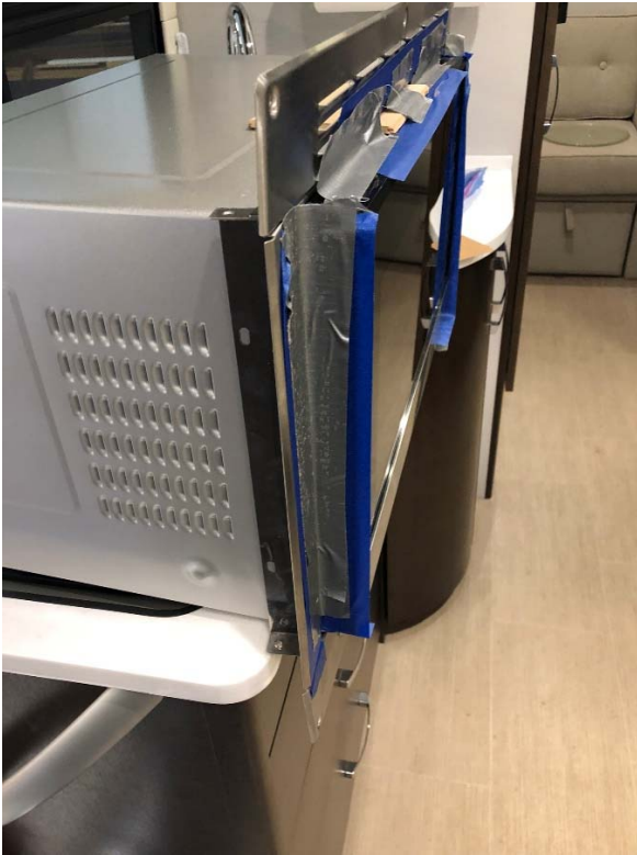
Microwave Replacement Photo 05