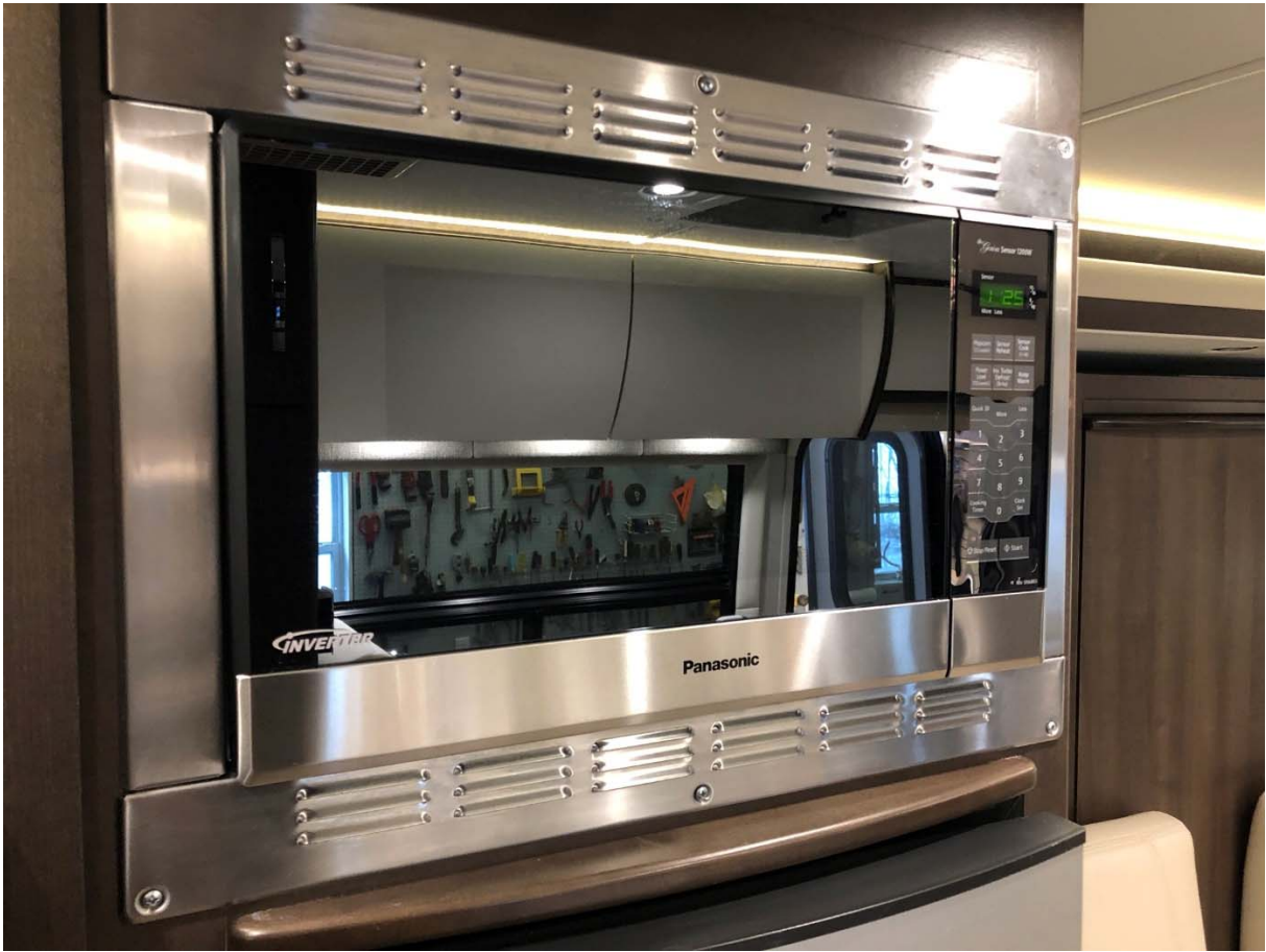
Microwave Replacement Photo 09