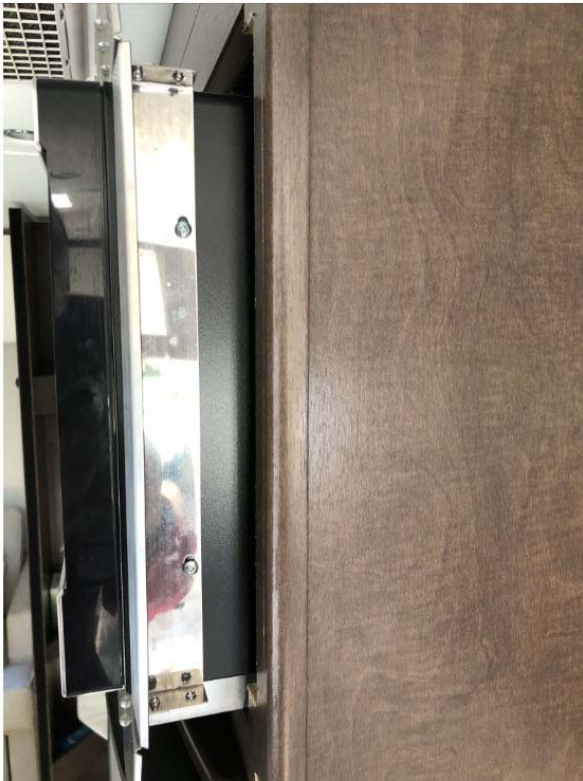
Microwave Replacement Photo 01