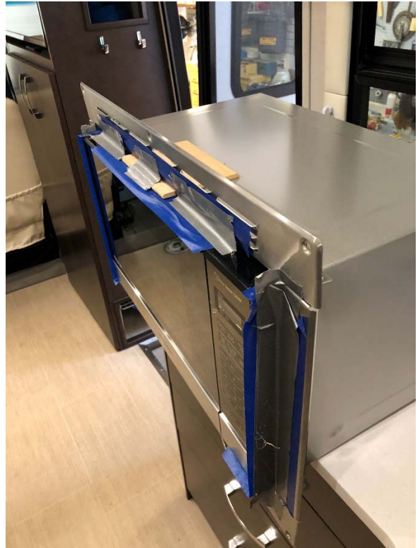
Microwave Replacement Photo 06