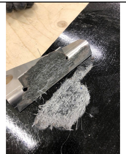
Broken-off strut bracket.